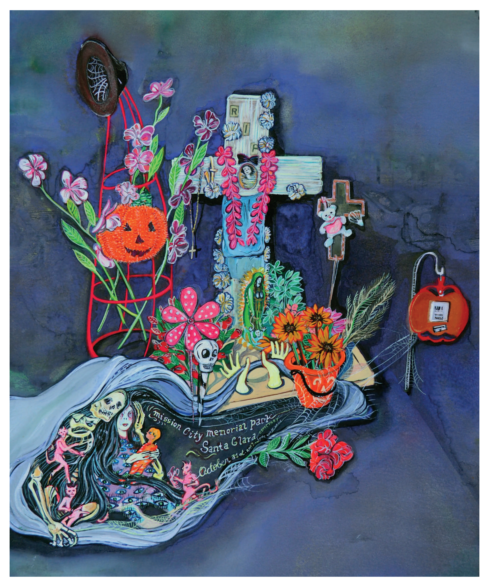
Untitled | Gouache on paper | 21x29,7cm | 1300 Euro